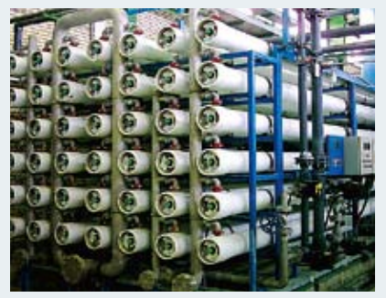
CLIENT: SSACO (Chemical Industry) LOCATION: Mideast SERVICE: EPC and operation & maintenance service of DI water for process and boiler of power plant